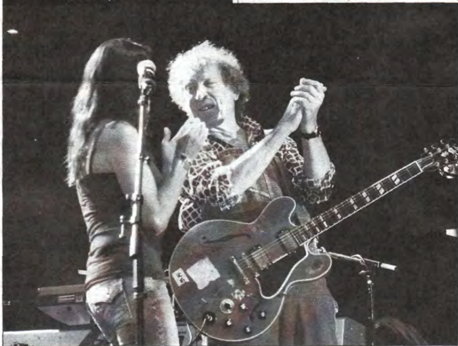
Elvin Bishop teachin' a fan.